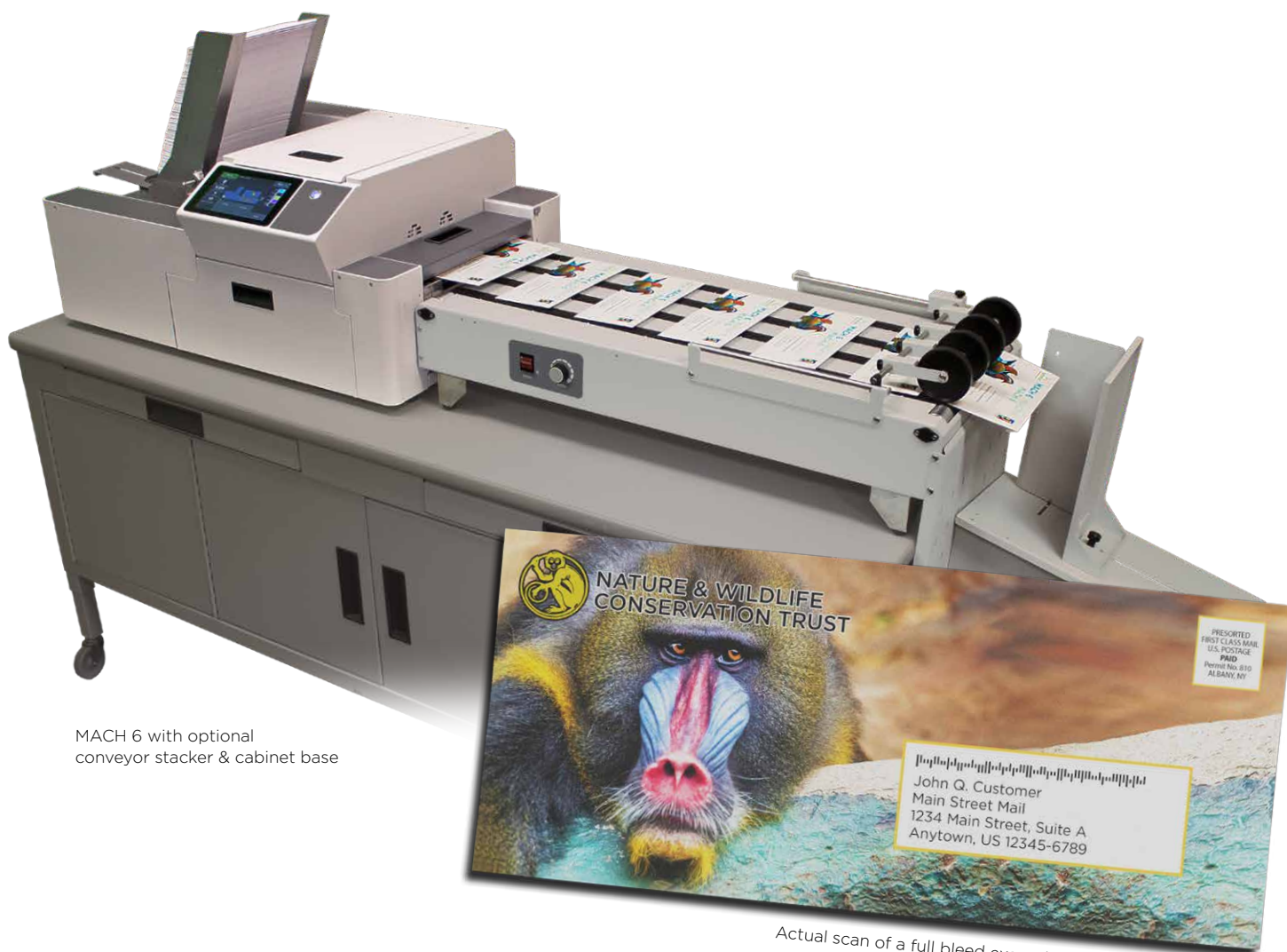
MACH 6 with optional conveyor stacker & cabinet base

Actual scan of a full bleed example printed on the MACH 6